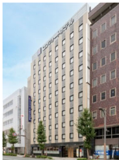
Comfort Hotel Hamamatsu (Ichigo Hotel-Owned)

1 Choice Hotels International is a US company and one of the largest lodging franchisors in the world.