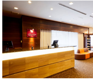
Hotel Wing International Kobe Shin Nagata Ekimae (Ichigo Hotel-Owned)