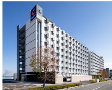
Comfort Hotel Central International Airport (Ichigo Hotel-Owned)