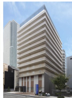
Comfort Hotel Kobe Sannomiya