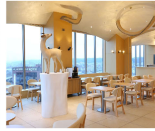
Hotel Wing International Premium Kanazawa Ekimae