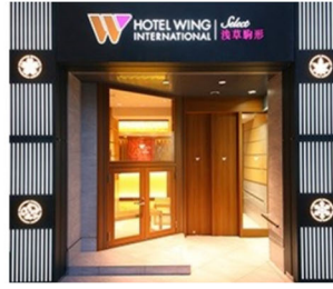
Hotel Wing International Select Asakusa Komagata