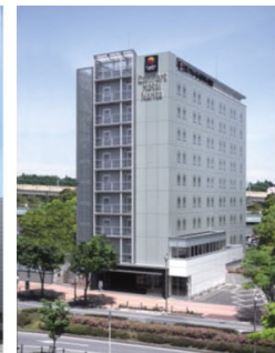
Comfort Hotel Narita