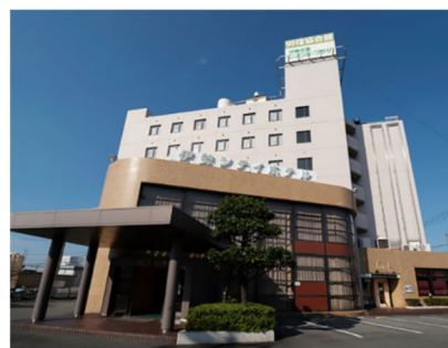
Ise City Hotel