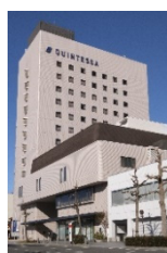
Quintessa Hotel Ogaki (Ichigo Hotel-Owned)