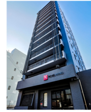
Hotel Wing International Takamatsu