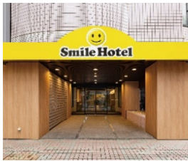
Smile Hotel Tokyo Asagaya (Ichigo Hotel-Owned)

1 Some hotels are operated by related parties and franchisees of Hospitality Operations.