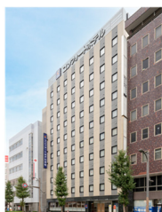
Comfort Hotel Hamamatsu (Ichigo Hotel-Owned)