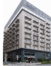
HOTEL THE KNOT YOKOHAMA (Ichigo Hotel- Owned)