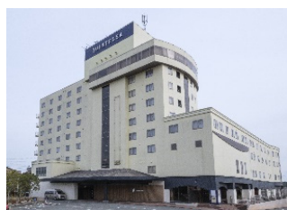
Quintessa Hotel Ise Shima (Ichigo Hotel-Owned)