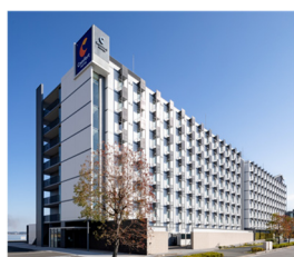
Comfort Hotel Central International Airport (Ichigo Hotel-Owned)