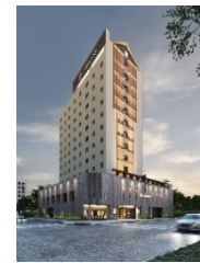
Hotel Enoe Hakodate