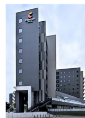
Comfort Hotel Nagoya Kanayama