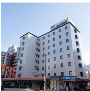
Hotel Econo Kanazawa Ekimae

From late April 2021 (starting on dividend payment date) until March 31, 2022