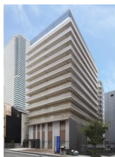
Comfort Hotel Kobe Sannomiya