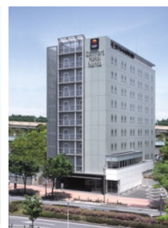
Comfort Hotel Narita