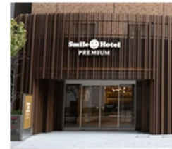
Smile Hotel Premium Kanazawa Higashiguchi Ekimae