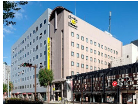
Smile Hotel Nagano (Ichigo Hotel-Owned)