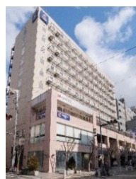
Comfort Hotel Osaka Shinsaibashi (Ichigo Hotel-Owned)