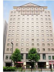
Hotel Wing International Premium Tokyo Yotsuya