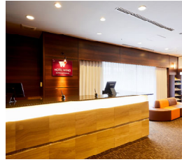
Hotel Wing International Kobe Shin Nagata Ekimae (Ichigo Hotel-Owned)