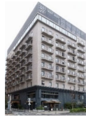
HOTEL THE KNOT YOKOHAMA (Ichigo Hotel-Owned)