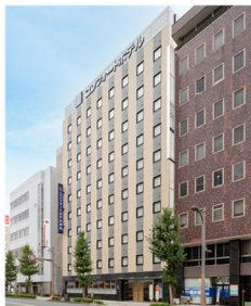
Comfort Hotel Hamamatsu (Ichigo Hotel-Owned)

1 Choice Hotels International is a US company and one of the largest lodging franchisors in the world.