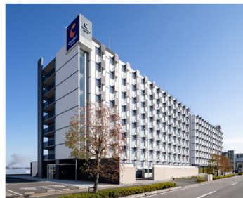
Comfort Hotel Central International Airport (Ichigo Hotel-Owned)