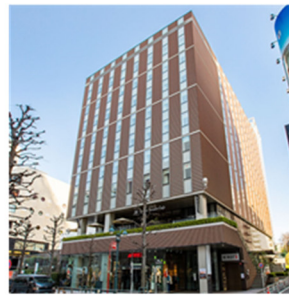
Hotel Wing International Premium Shibuya