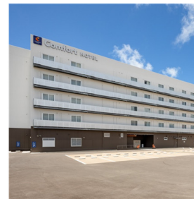
Comfort Hotel Ishigakijima