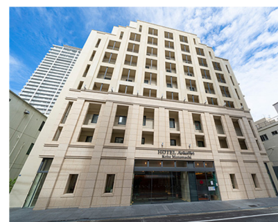
HOTEL Meriken Port Kobe Motomachi