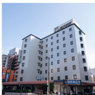
Hotel Econo Kanazawa Ekimae