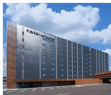
Hotel around TAKAYAMA