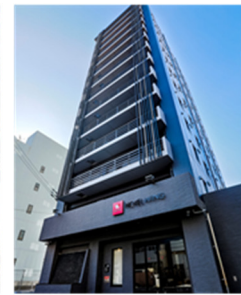
Hotel Wing International Takamatsu