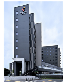
Comfort Hotel Nagoya Kanayama