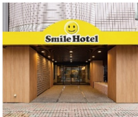
Smile Hotel Tokyo Asagaya (Ichigo Hotel-Owned)

1 Some hotels are operated by related parties and franchisees of Hospitality Operations.