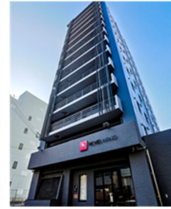
Hotel Wing International Takamatsu