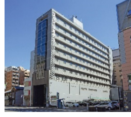
Smile Hotel Kyoto Shijo (Ichigo Hotel-Owned)