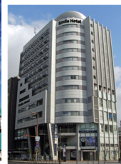
Smile Hotel Osaka Yotsubashi