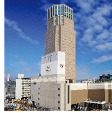
Hotel Emisia Sapporo